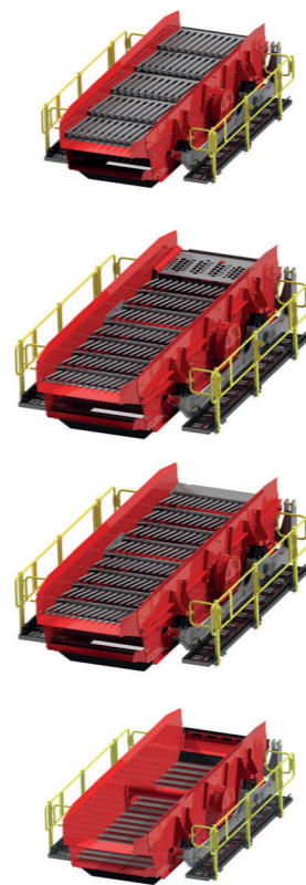
Ability to configure with punch plate, grizzly fingers, bofar bars, mesh or lower deck cascade fingers.