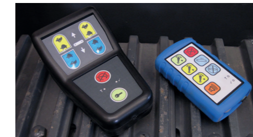
Remote control for ease of mobility