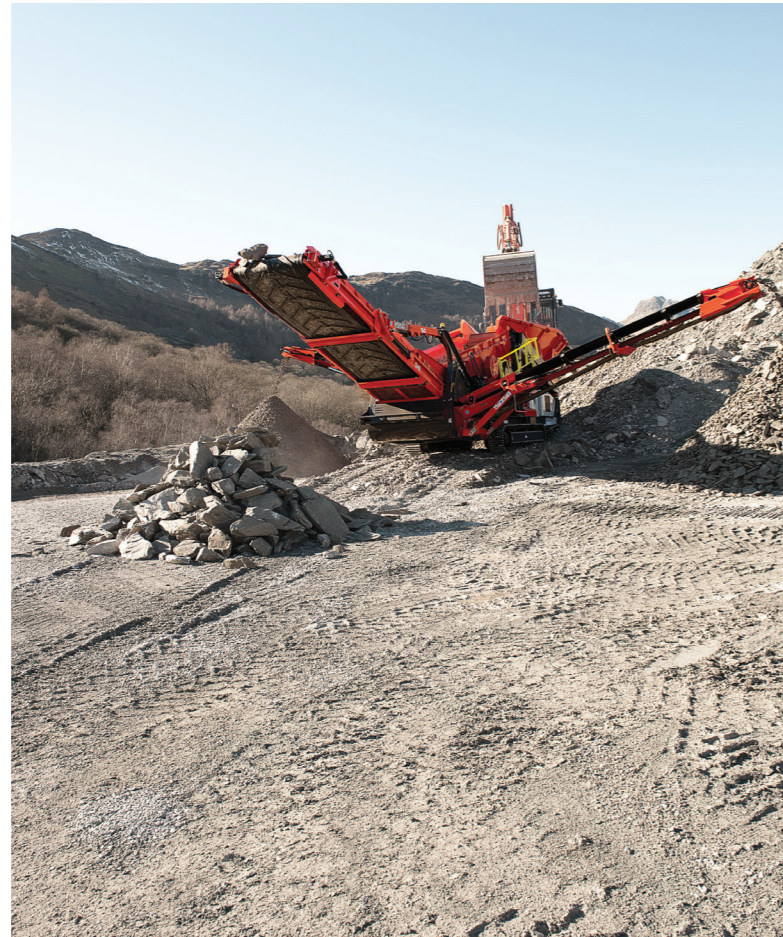
Optional Hybrid drive, allowing mains electric plug in.