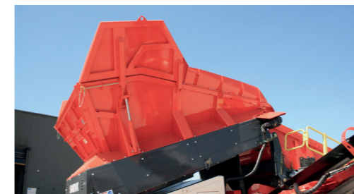
One piece hopper shown with optional hopper extensions and full length outlet flares