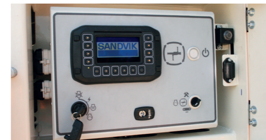
Simplified control panel for ease of operation