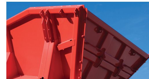
Split rear hopper door for direct feeding