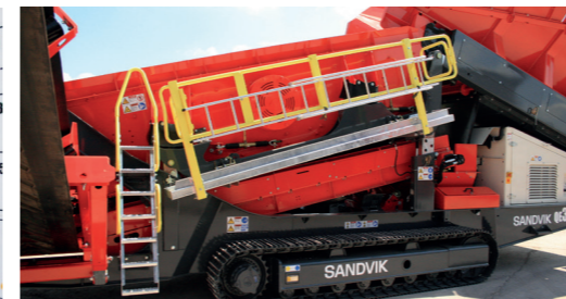
Hydraulically folding maintenance platforms