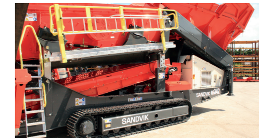
Screen box jack up facility allows easy access