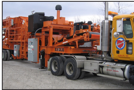
Easy, one-pull transport. Check with your DOT.