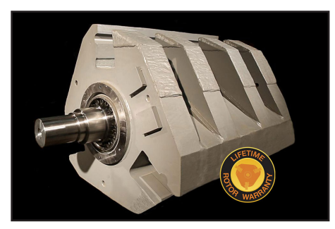
Solid-steel, three-bar, sculptured rotor with LIFETIME ROTOR WARRANTY, North America only.

CV refers to the discharge conveyor coming straight out from the front of the impactor plant.