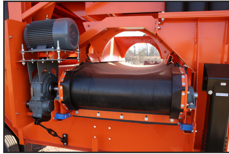
Versatile, 42" reversible cross conveyor allows feeding into the stacking conveyor from either side of the plant and features 5' impact bed and idlers.