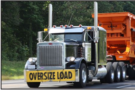
Easy, one-pull transport. Check with your DOT.