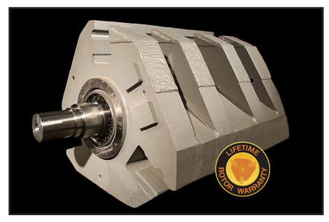
Solid-steel, three-bar, sculptured rotor with LIFETIME ROTOR WARRANTY, North America only.