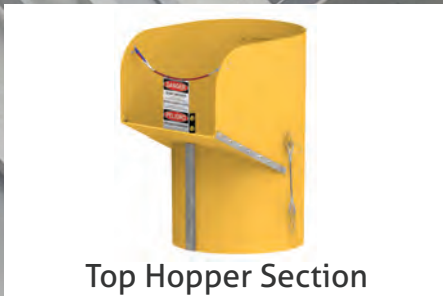
Top Hopper Section