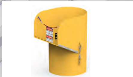
Top Hopper Section