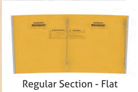
Regular Section - Flat